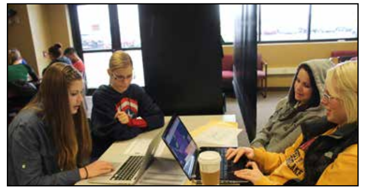
Red River Area Learning Center students and Minnesota State University Moorhead education students work on designing a logo as part of their business plan to address a food-related issue.

All Red River Area Learning Center students will develop 21st century skills related to communication, collaboration, creativity, and critical thinking, as evidenced by AVID learning walks conducted during advisoradvisee classes.