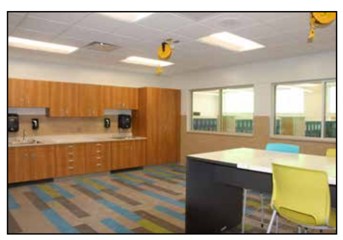
Each learning community at Horizon Middle School West Campus has a maker space for hands-on project-based learning.

Original Construction: 2017 Square Footage: 198,573