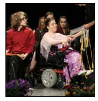
A Moorhead High School senior accepts her honor cords after being recognized as a salutatorian at the academic awards night.

the 2017 Destination Imagination state tournament.