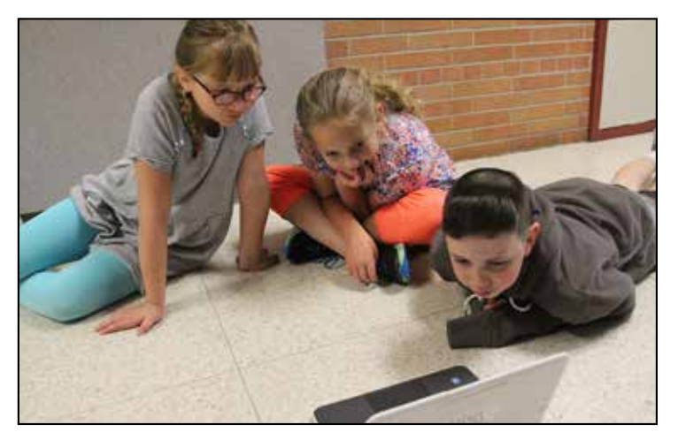
A small group of Ellen Hopkins Elementary School third-grade students review their video project.

Ellen Hopkins Elementary School students in K-4 will demonstrate an increase in behavior that communicates respect, responsibility and safety that will be reflected in a 20% reduction from 1,118 to 894 of total major incidents and reduce the daily incident rate from an average of 6.5 incidents per day to 5.2 incidents per day during the 2017-18 school year.