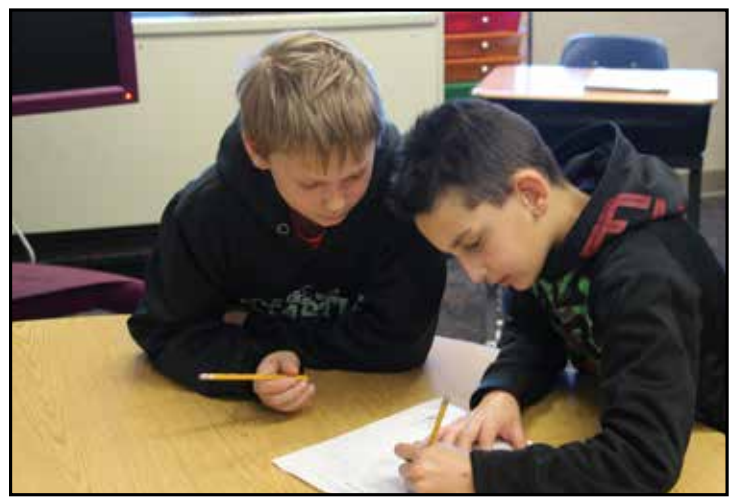
Robert Asp Elementary School students practice math skills with a math game.

All students will demonstrate an increase in behavior that communicates care, consideration, and respect of self that will be reflected in a 10 percent reduction of total major and minor incidents (a decrease from 651 incidents in 2016-17 to 587 incidents) and a reduction in the daily incident rate from an average of 3.36 per day (2016-17) to 2.75 per day in 2017-18.