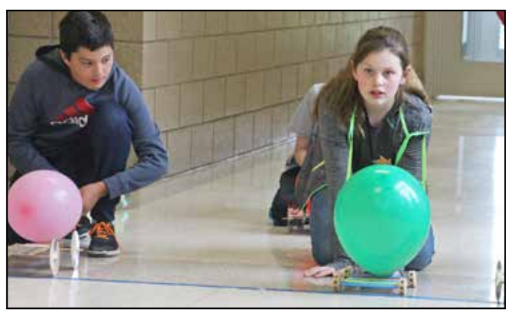
A Horizon Middle School student prepares to launch her balloon racer.

Student use of the 4Cs of communication, collaboration, critical thinking and creativity will increase from 1020 to 1030 based on the 2018 student BrightBytes survey.