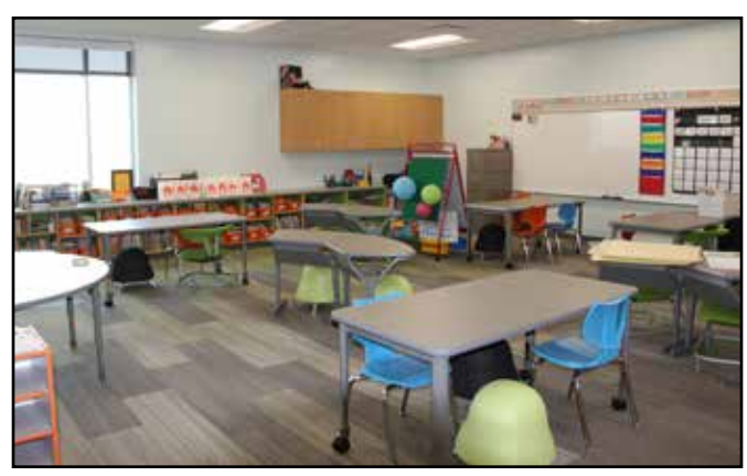
Classrooms at Dorothy Dodds Elementary School have flexible furniture to easily adapt for different activities like small group learning or full class instruction.

Original Construction: 2017 Square Footage: 110,000