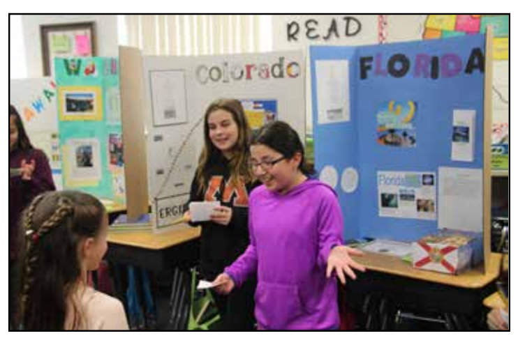
At the school's fourth-grade States Fair, S.G. Reinertsen Elementary School students share facts about their states with visiting students from other grade levels.

Office discipline referrals (ODR) in grades K-4 will decrease from 3 referrals per day to 1.5 referrals per day.