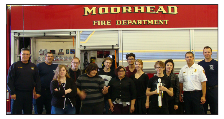
As research for the robotics competition, Red River Area Learning Center robotics team members tour the Moorhead Fire Station. The team exhibit was based on a fire-fighting theme.

Red River Area Learning Center will work with key stakeholders, including community representatives and parents, to complete a comprehensive needs assessment using multiple data points to identify significant barriers to graduation and prioritize areas for improvement that will be addressed through a long-range comprehensive plan. The improvement plan will include evidence-based practices, intervention strategies, and related accountability measures that address strategic priorities and ensure student success.