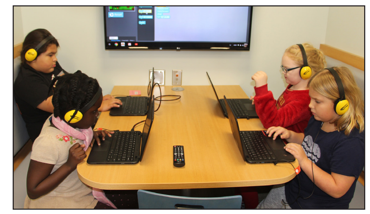
Dorothy Dodds Elementary School third-grade students participate in Hour of Code, selecting from one of the modules to learn the basics of coding.

All Dodds staff will incorporate 21st century skills, tools, and teaching strategies within the context of core academic subjects throughout the 2018-2019 school year.