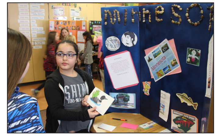
At the school's fourth-grade States Fair, S.G. Reinertsen Elementary School students share facts about their states with visiting students from other grade levels

100% of students will have the opportunity to participate in 4C-based activity through co-teaching between the library resource strategist and classroom teacher, as measured by the building plan for support.