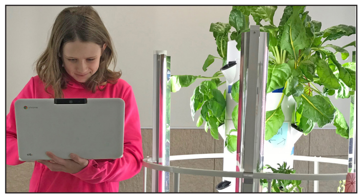
A sixth-grade group at Horizon Middle School West Campus explores variables in science by comparing hydroponic tower gardening to traditional gardening, documenting data for both growing methods. The students ended the hands-on unit with a food fest, including salad and pesto made from the plants they grew.